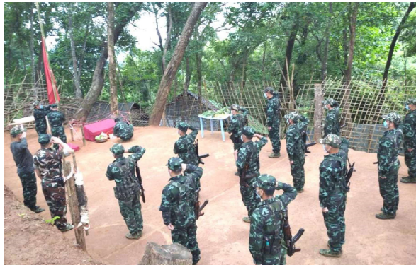
IT News Imphal, Aug 18:

Armed rebel group Kanglei Yawol Kanna Lup (KYKL) today observed Athoubasinggi Ningsing Numit (Martyrs memorial day) by paying tribute to the revolutionary cadres who had given up their lives for the cause of the freedom of WESEA region by bringing change to the political, economic and society. The observance was held at the 1 st , 2 nd and 3rd Army battalion, units, transit camp and other area of WESEA region, a statement of the outfit said.